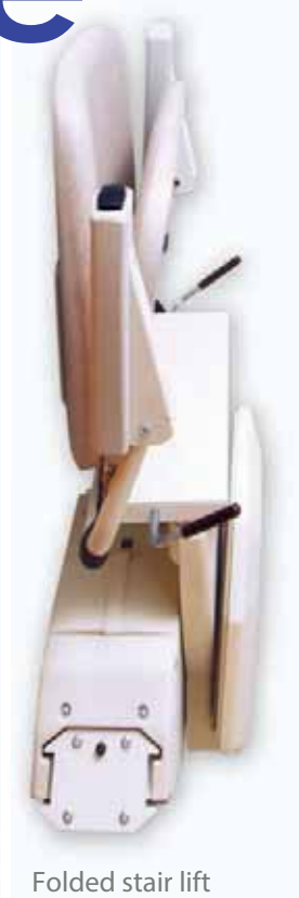
Folded stair lift

Ultra-Thin Design Great for narrow cases